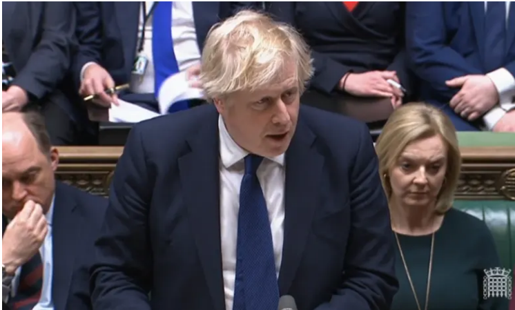
Boris Johnson updating MPs in the House of Commons on the latest situation regarding Ukraine.

Putin will stand condemned in the eyes of the world and history. He will never be able to cleanse the blood of Ukraine from his hands.