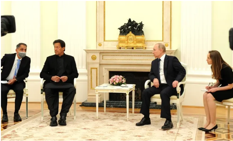
Imran Khan and Vladimir Putin meeting at the Kremlin Palace in Moscow on Thursday.