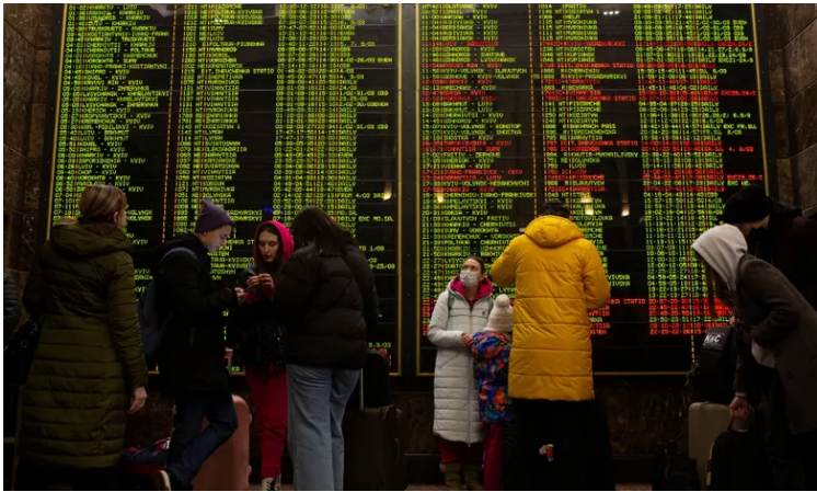
People stand in front of the train schedule at Central Railway Station as they try to leave Kyiv.