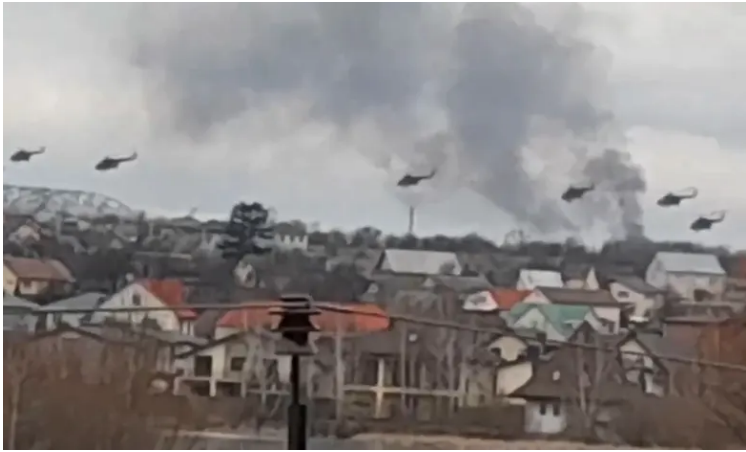
Military helicopters apparently Russian, fly over the outskirts of Kyiv, Ukraine

ending software licenses for military and civilian equipment in Russia and Belarus; blocking or interfering with Russian satellite navigation systems in the air, over the Black Sea and Sea of Azov; using all means to block the Russian satellite navigation system Glonass , including jamming its signal over the Black Sea, Sea of Azov, Belarus and Ukrainian airspace. As well as an appeal to end “business as usual” with Russia , Kyiv wants the EU to open its emergency aid system (the civil protection mechanism) to Ukrainians.