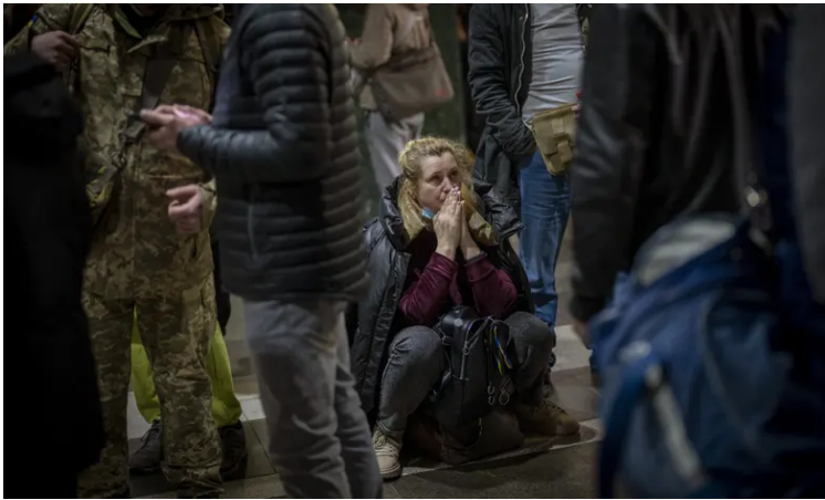
A woman reacts as she waits for a train trying to leave Kyiv, Ukraine, on Thursday.